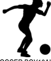
SOCCER BOY16A! =