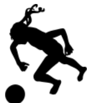
SOCCER GIRL12A! =