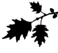
OAK RED LEAF=