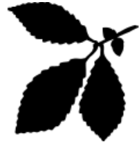
CHINKAPIN TREE LEAF