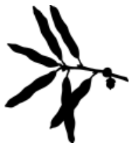
OAK WILLOW LEAF=