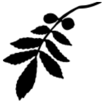
HICKORY TREE LEAF