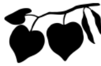
REDBUD EASTERN LEAF