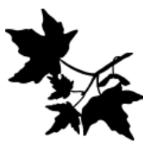
MAPLE SUGAR LEAF=