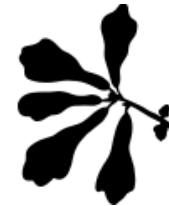
OAK WATER LEAF