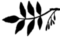
ASH TREE LEAF