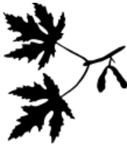
MAPLE SILVER LEAF