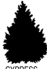
CYPRESS ARIZONA TREE