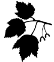
MAPLE TREE LEAF