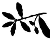
OAK LIVE LEAF