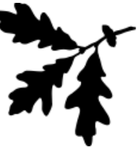
OAK WHITE LEAF