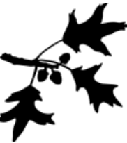
OAK PIN LEAF=