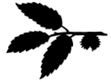
CHESTNUT TREE LEAF=