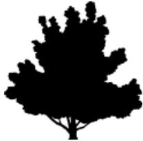
DOGWOOD WHITE TREE=