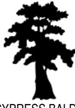
CYPRESS BALD TREE=