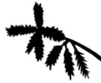
REDWOOD TREE LEAF