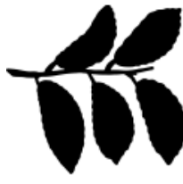
ELM TREE LEAF=